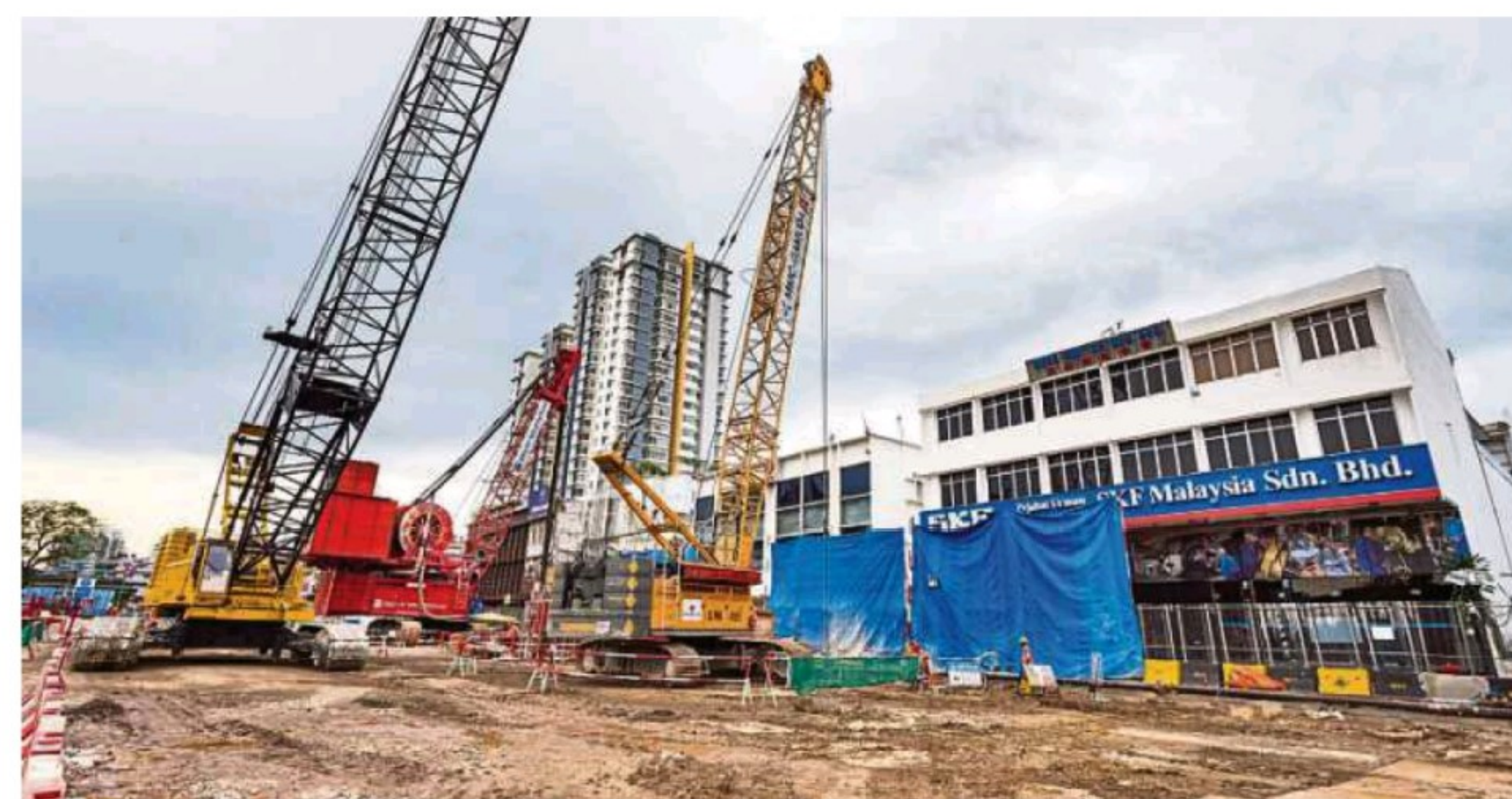
View of the upcoming Sentul West station. The construction of the underground portion of the SSP MRT line is testing the limits of plant and machinery as there is a need to mitigate many risks.