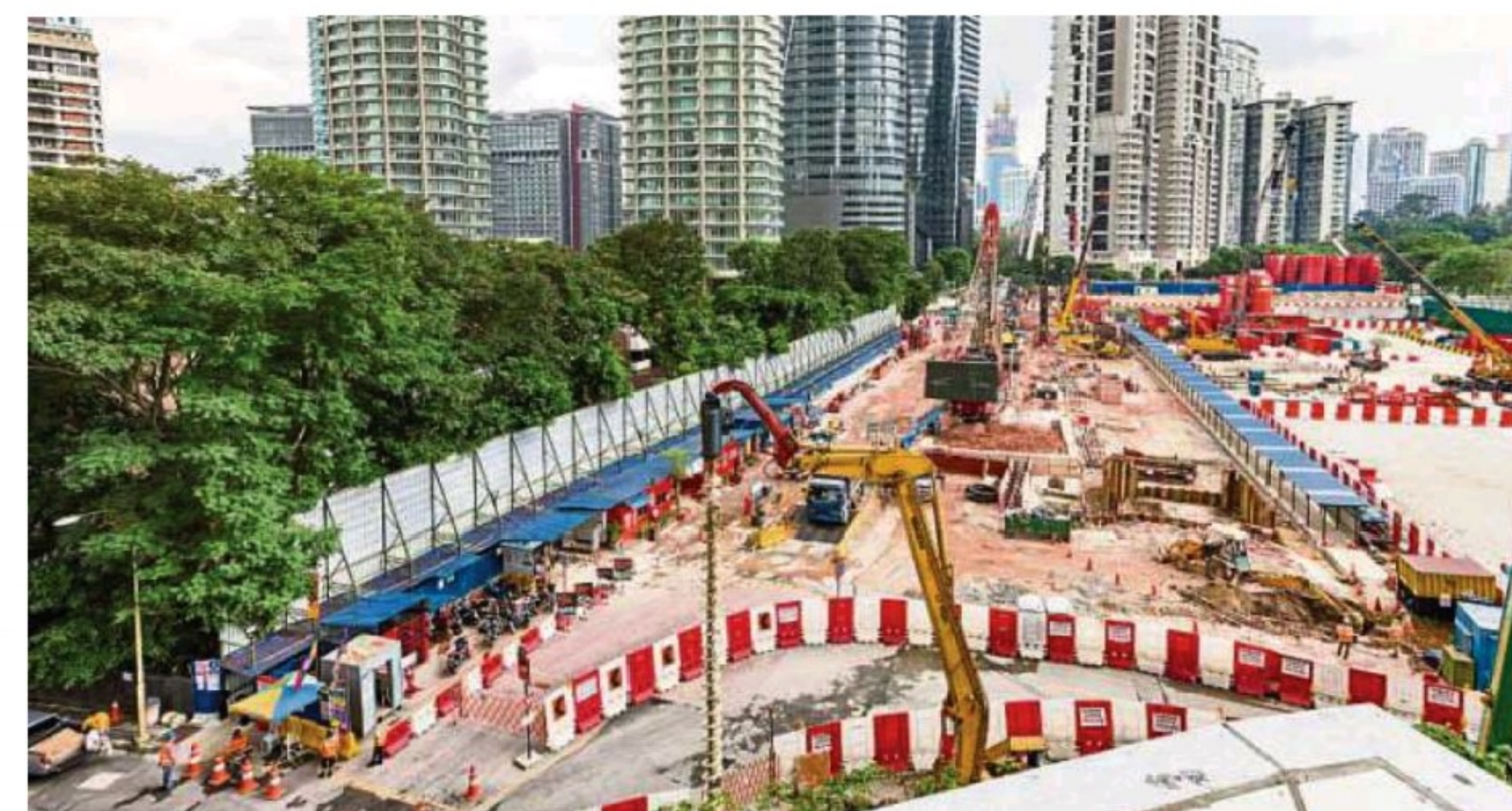
View of the KLCC East station of the SSP Line as of September 2017. The construction of this particular station and the tunnels that come with it is very challenging, given that a high-rise tower will spring up after the station box is completed.

cal fault lines, which presents another set of problems. Faults are complex zones ranging from metres to kilometres in width, and often consist of seemingly random bands of hard and soft materials, all subject to a variety of geological stress histories.