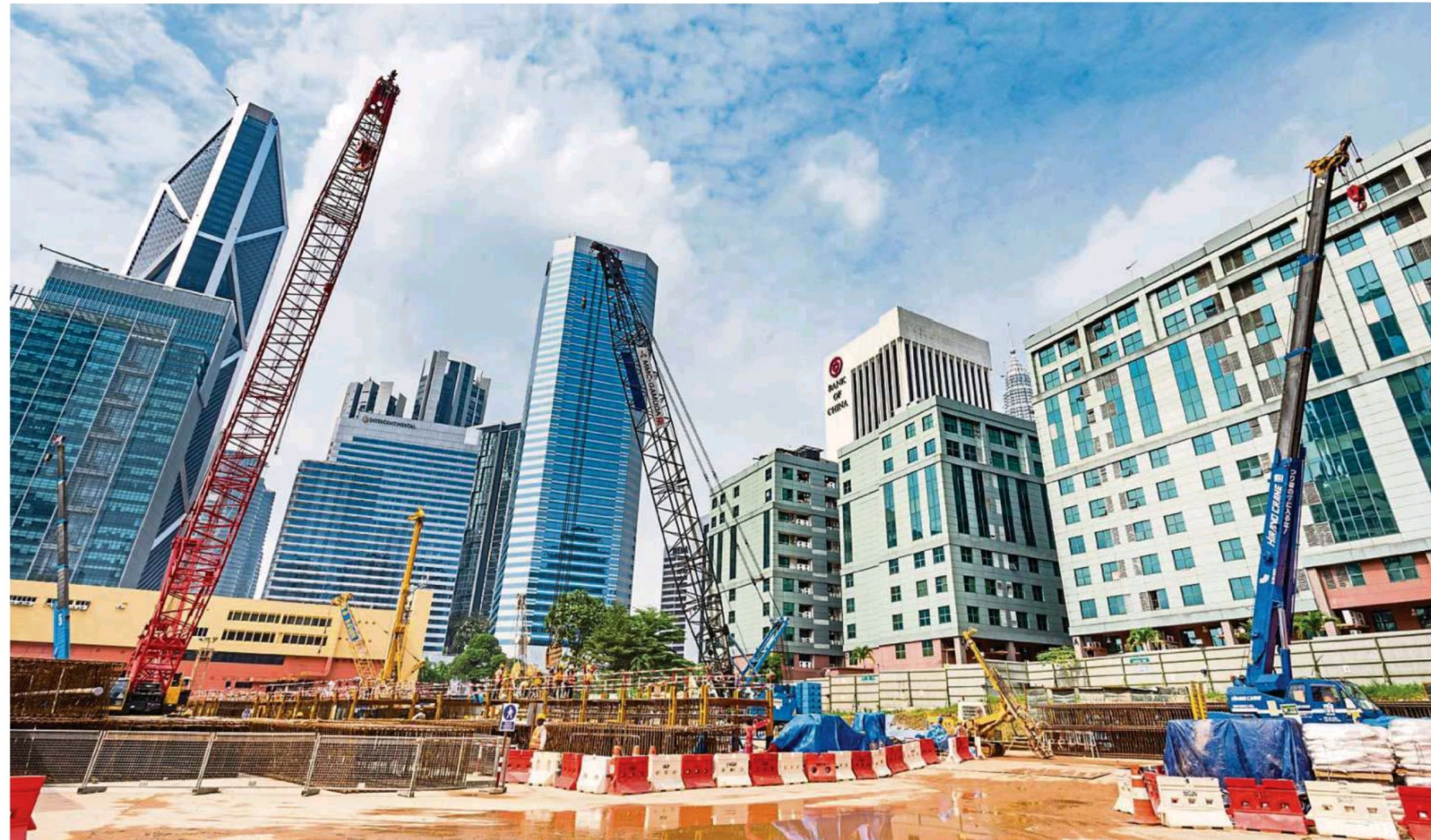
View of the future KLCC East station of the SSP MRT line.

The SSP tunnels also traverse seven (both actual and inferred) geologi-