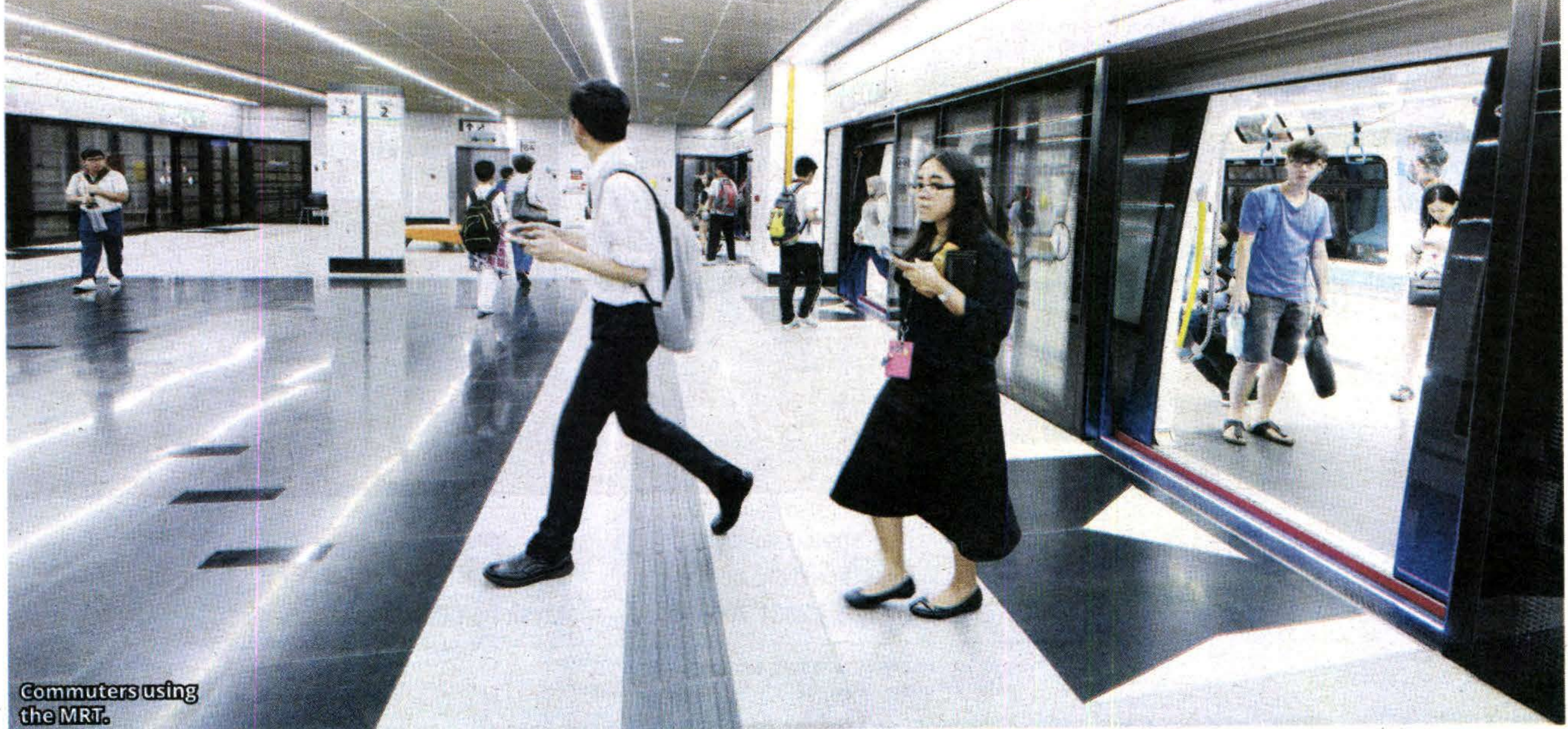
Commuters using the MRT.