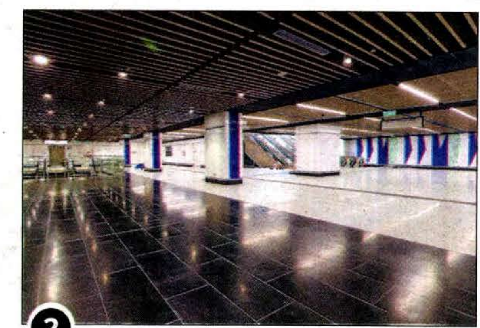
2 Pasar Seni