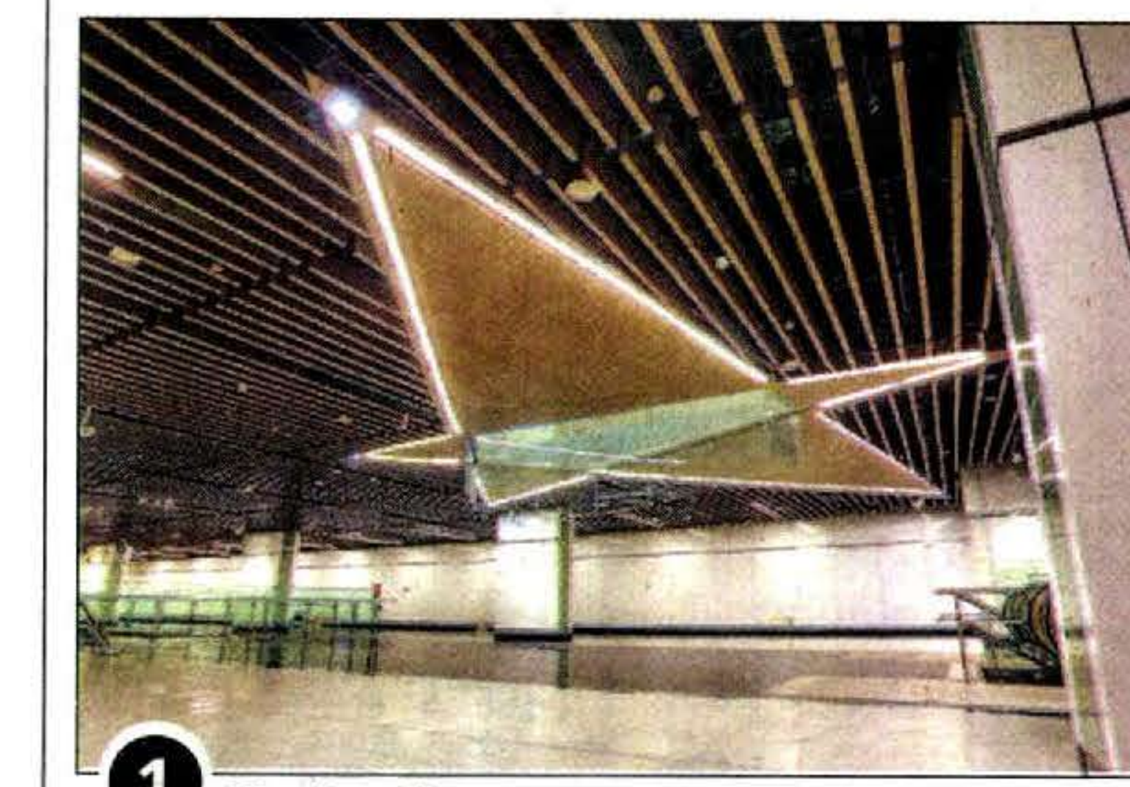
1 Muzium Negara