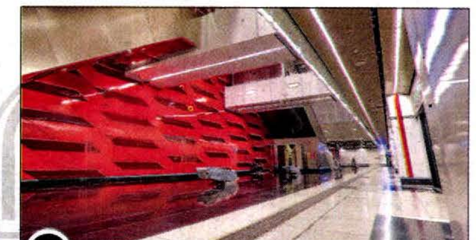
4 Bukit Bintang