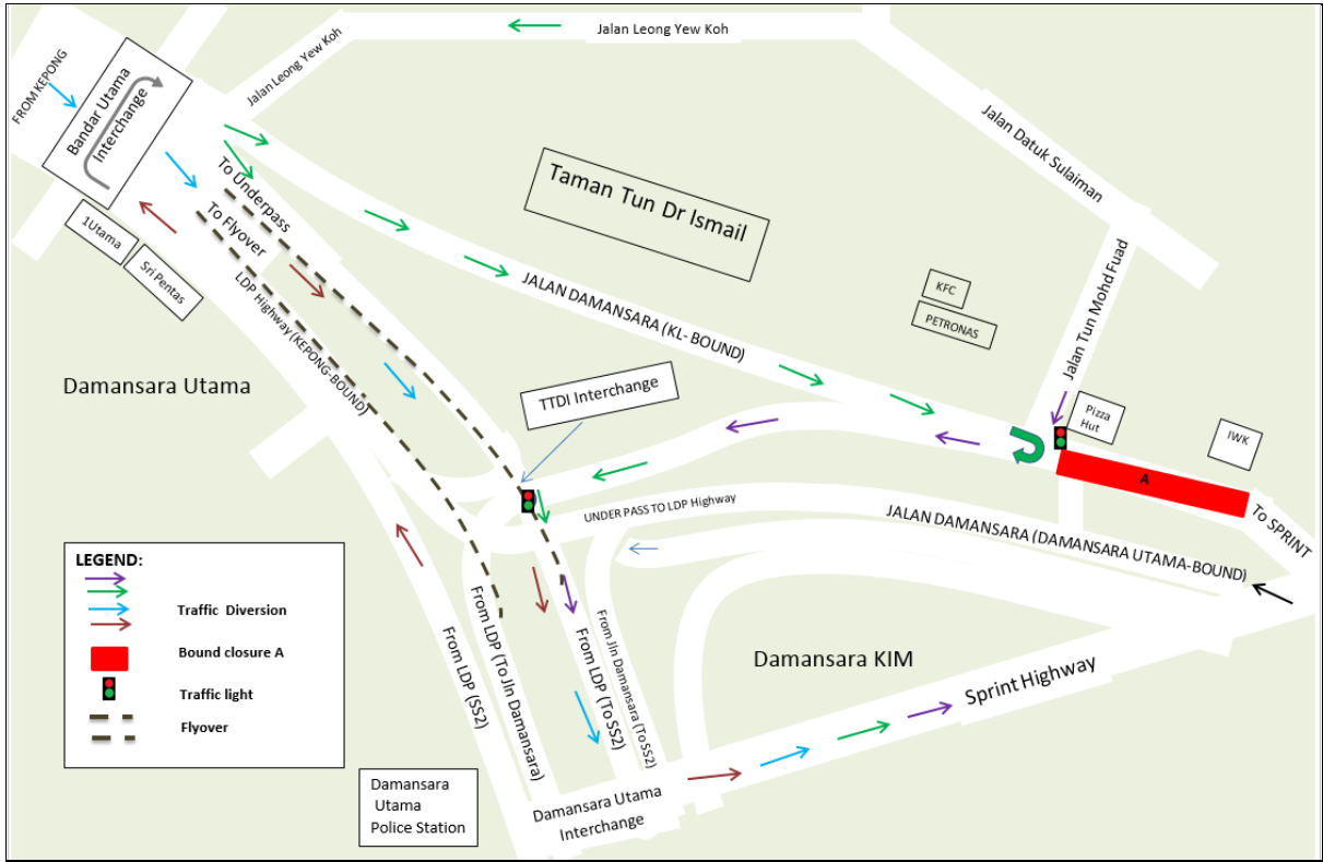
MAP 2 : BOUND CLOSURE FROM PIZZA HUT TO IWK (CLOSURE A)