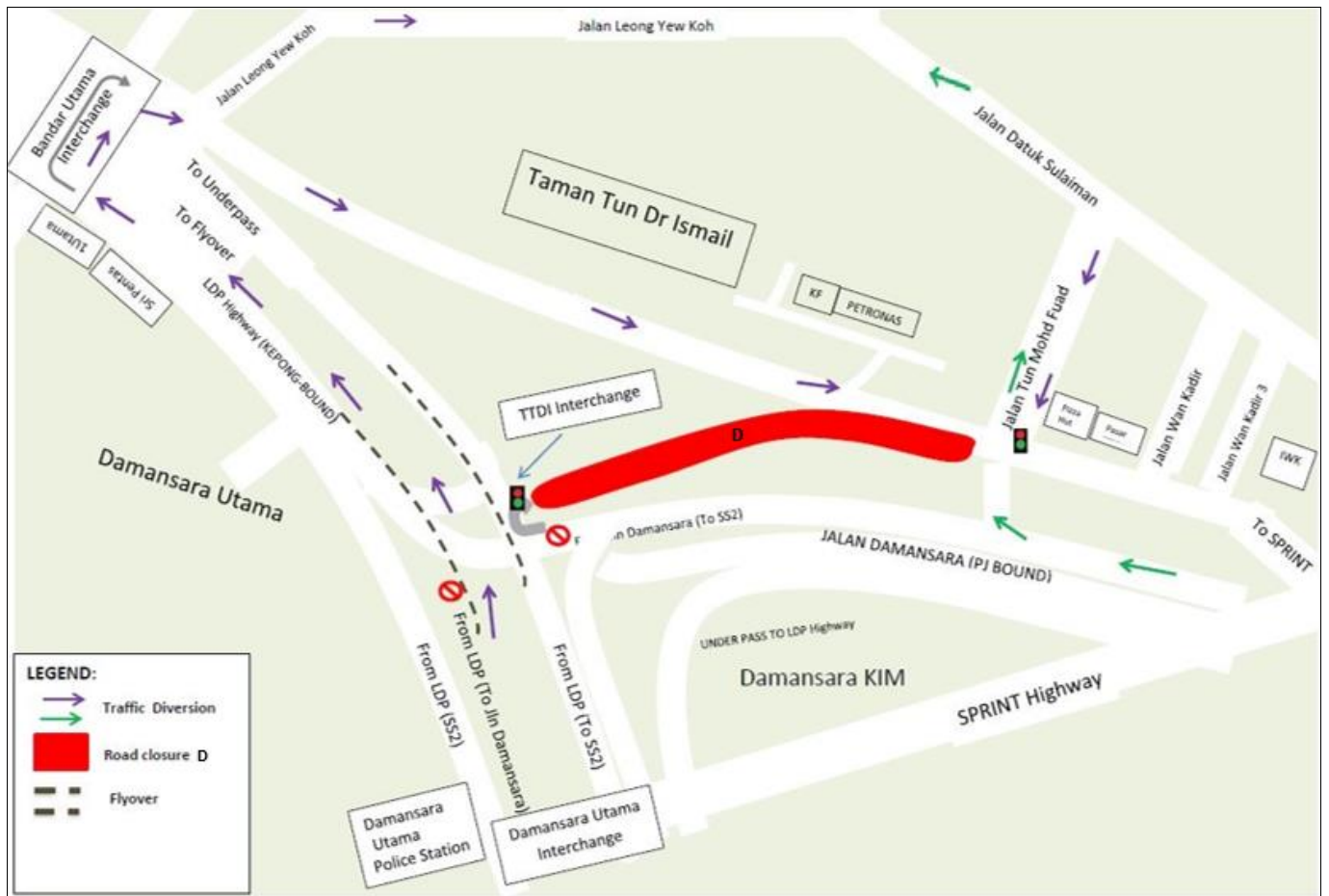
MAP 5: CLOSURE OF U-TURN TO TTDI AND ACCESS ROAD TO JALAN DAMANSARA FROM SS2 (CLOSURE D)