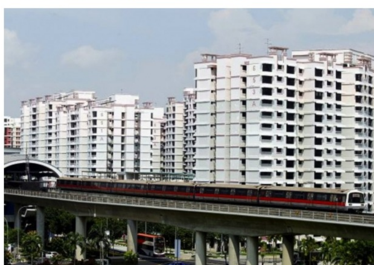
Najib said that the MRT currently has 19 trains and would receive another 35 by the middle of next year.

TOOLS INCREASE TEXT DECREASE TEXT RESET TEXT PRINT ARTICLE