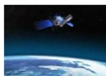
Avoiding another MH370: Deal on satellite tracking of flights