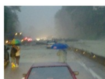
ProjekMMO: Pengguna Lebuh raya KL-Karak lari lepas tanah runtuh