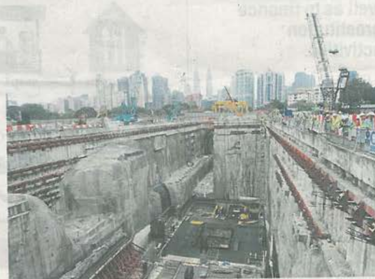
Work in progress: The TRX station is the deepest among the seven underground stations in MRT Line 1 (Sungai Buloh-Kajang Line) with a depth of 45m and will have five levels.

"The progress for the elevated section stands at 49.2%," said Shahril.