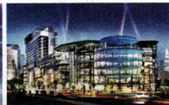
VIBRANT: Sunway Velocity is a sustainable integrated development catering to today's modern lifestyle