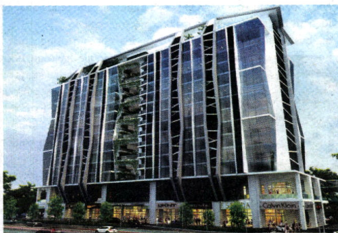
FLEXIBILITY: The newly launched Phase 3C1 Designer Office suites boast modular and flexible layouts

The latest phase will form part of a masterplan that has