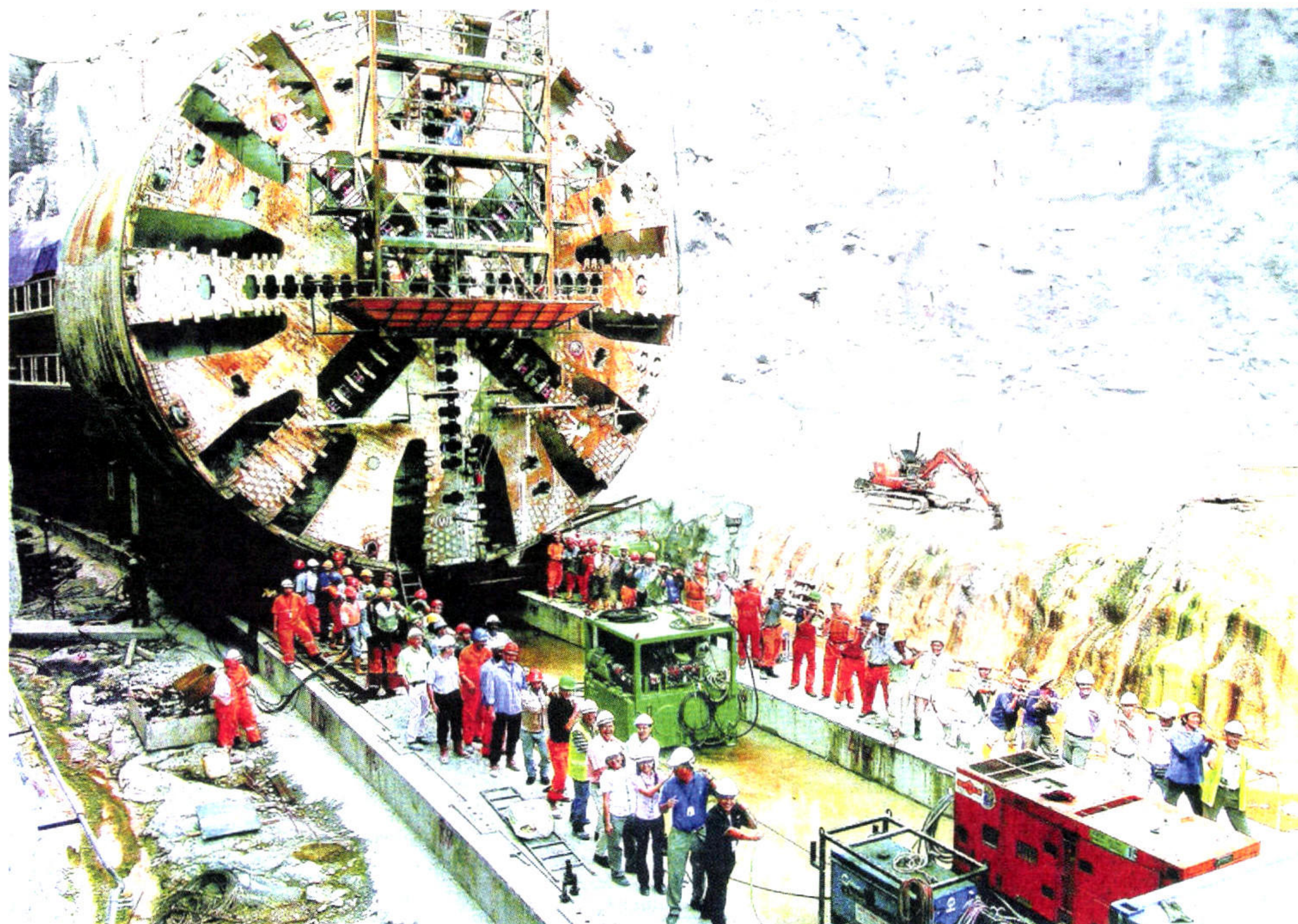
Maybank Kim Eng estimates a multiplier impact of 6.8 times on the domestic economy should a local player snag the tunnelling works.

Doubtless, winning the MRT's tunnelling portion would be a shot in the arm to Gamuda's orderbook,