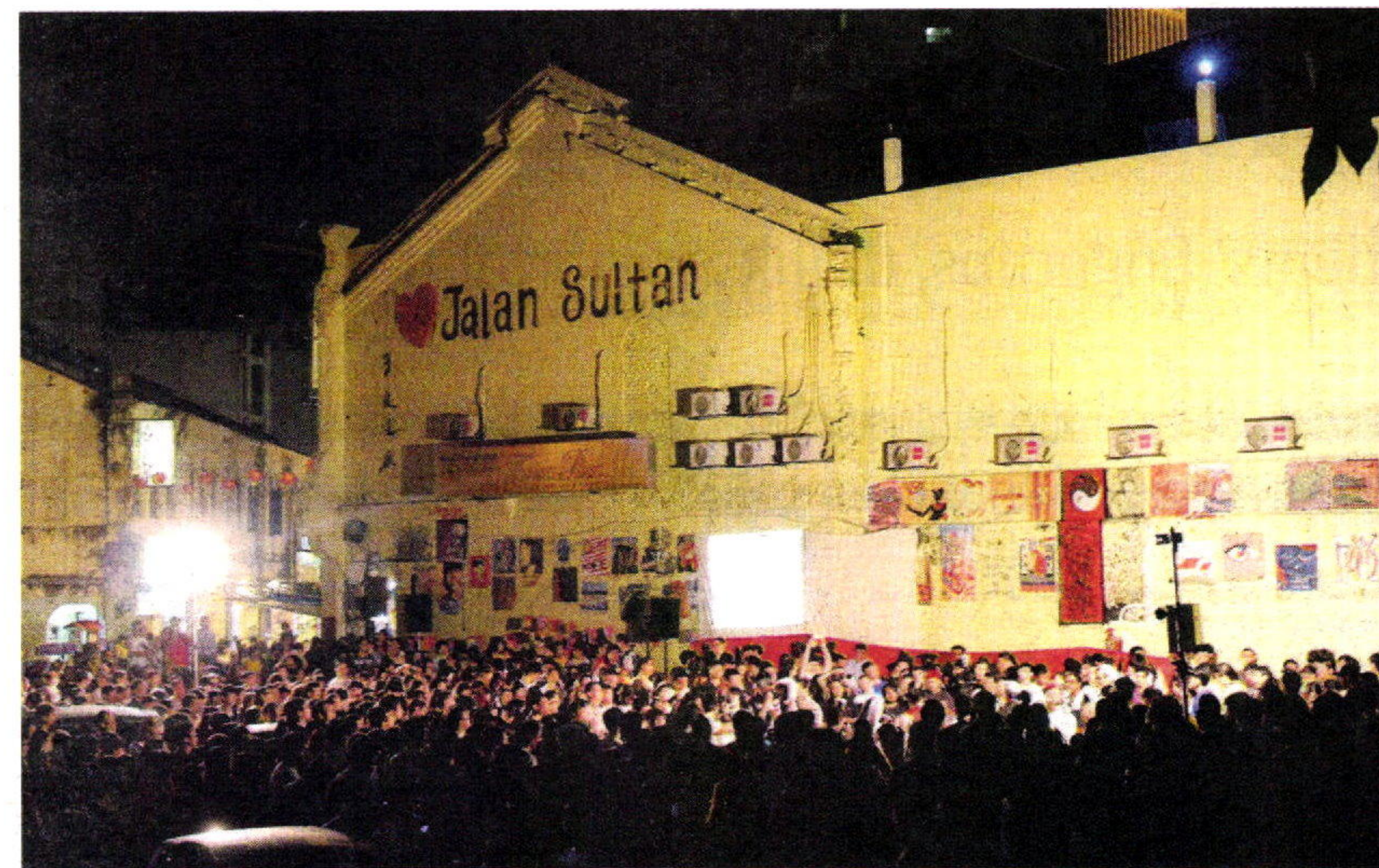
Large group: The crowd gathered at the carpark to watch performances in support of saving Jalan Sultan.