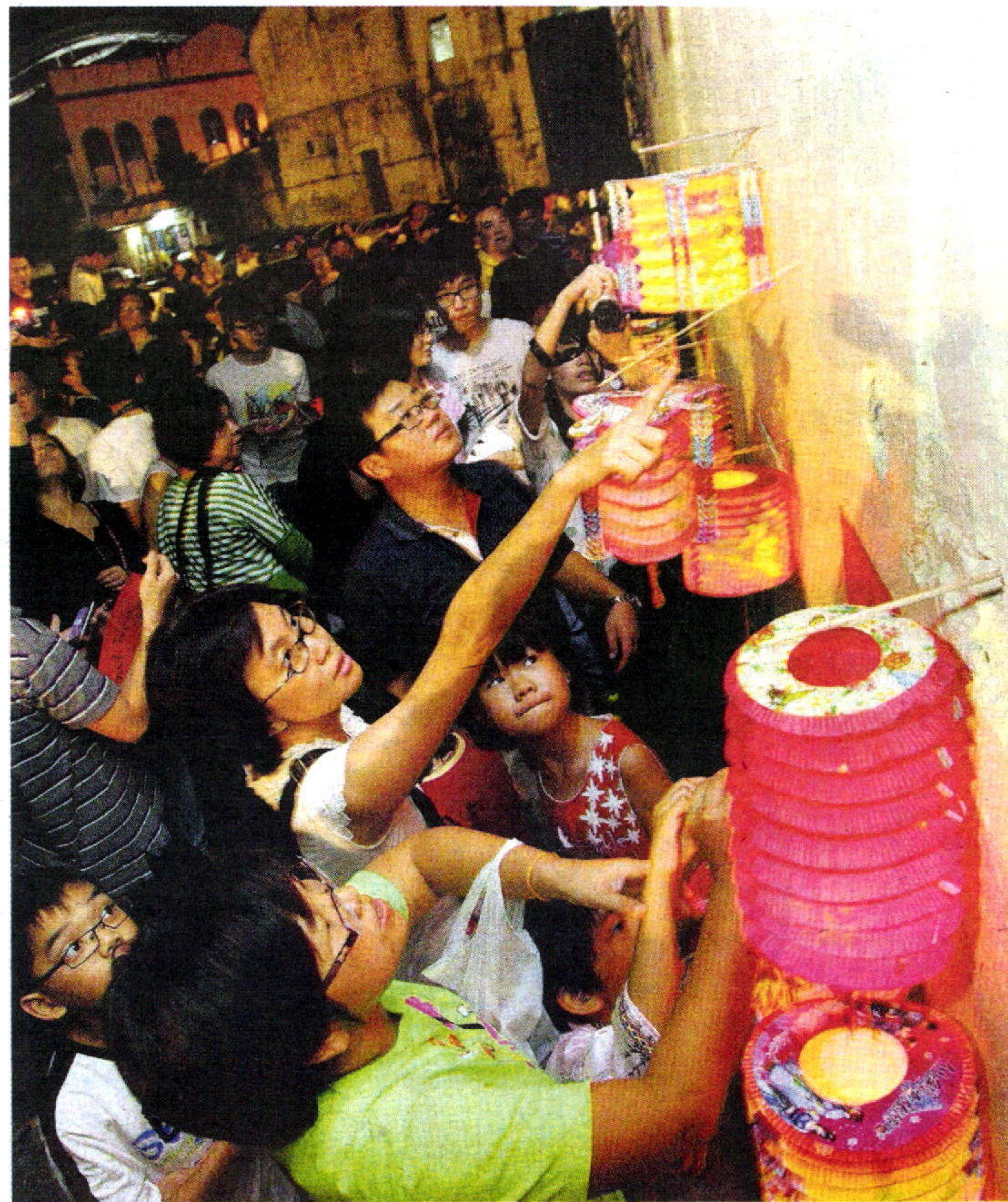
A tribute: People busy hanging their lanterns on the wall next to the carpark and KL Commercial Book Co shop.