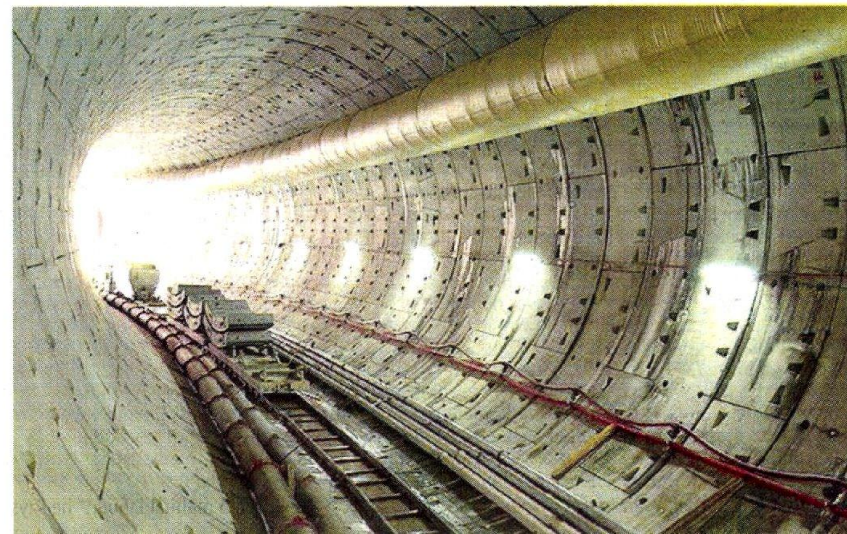
Gamuda and MMC have an edge as they have better understanding of Malaysia's soil conditions and experience in completing the SMART Tunnel.

"We do not discount a potential re-rating on the sector in the near future, pending more concrete signals," it says.